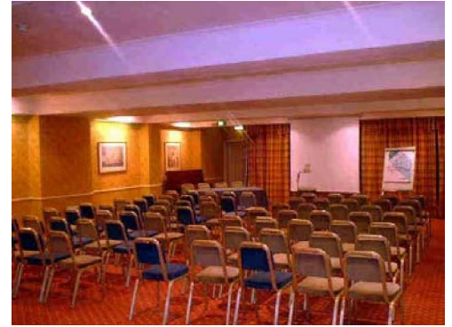
Conferences at Over-Seas House, Edinburgh