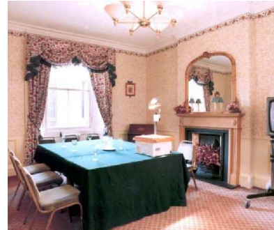
The Reading Room

This room faces the rear of the building and is suitable for small meetings of 10/12 people or as a breakout room for the adjacent Edinburgh Room.