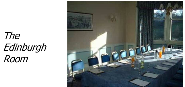
The Edinburgh Room