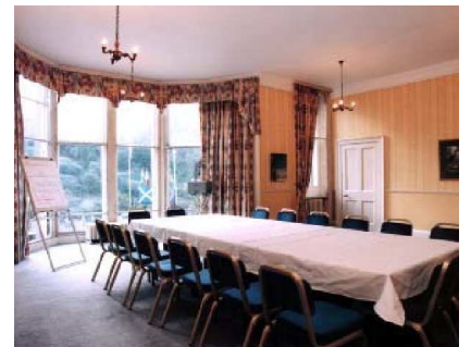
The Robert Louis Stevenson Room

A floor to ceiling bay window gives a fantastic backdrop for press conferences, meetings, lunches or dinners. The Club Room adjacent is available as a syndicate room to the RLS Room.